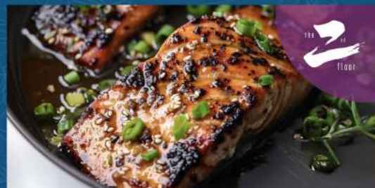
Baked Fjord Trout Fillet with Japanese Soya Sauce ☞ $26