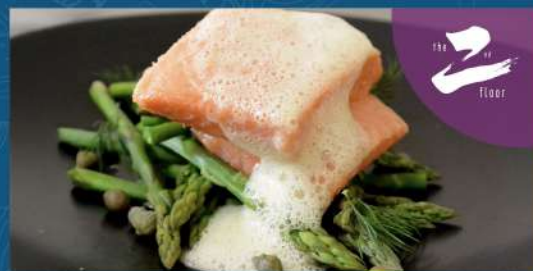
Steamed Fjord Trout with Green Primavera Sauce & Confit Lemon ☞ $28