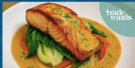
Grilled Fjord Trout with Baby Bok Choy, Capsicum & Coconut Curry Sauce ☞ $25