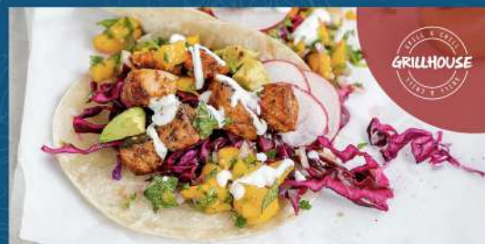
Texas Smoked Trout Tacos with Mango Salsa ☞ $22