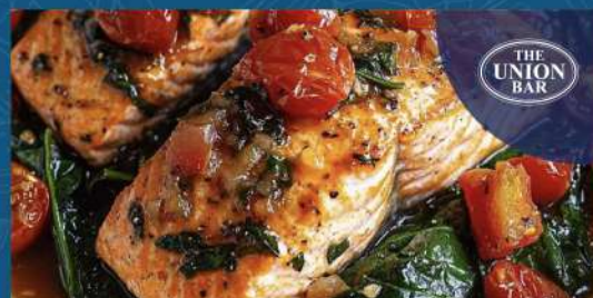
Pan-seared Fjord Trout with Sautéed Garlic Kale & Asparagus with Lemon Butter Sauce ☞ $28