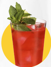
Summer Sour Splash