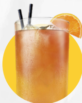
Código Tequila Sunrise