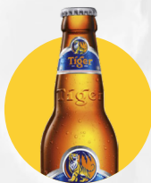
Tiger Beer (Bottle)