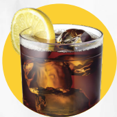
Jack & Coke